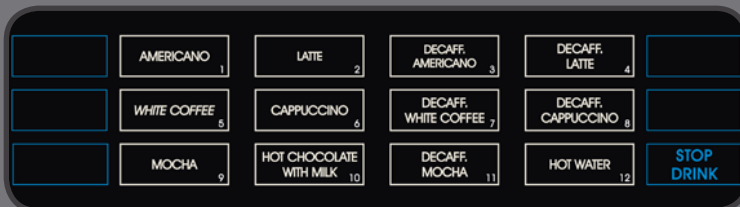
Recommended button config for Self Serve