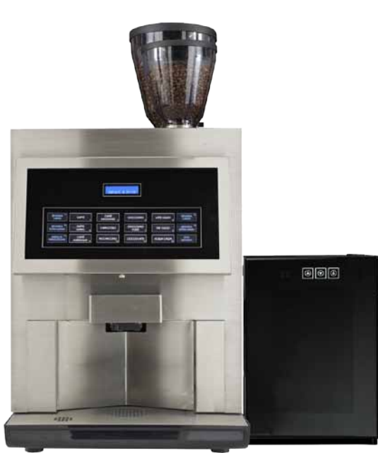
Optional fridge available